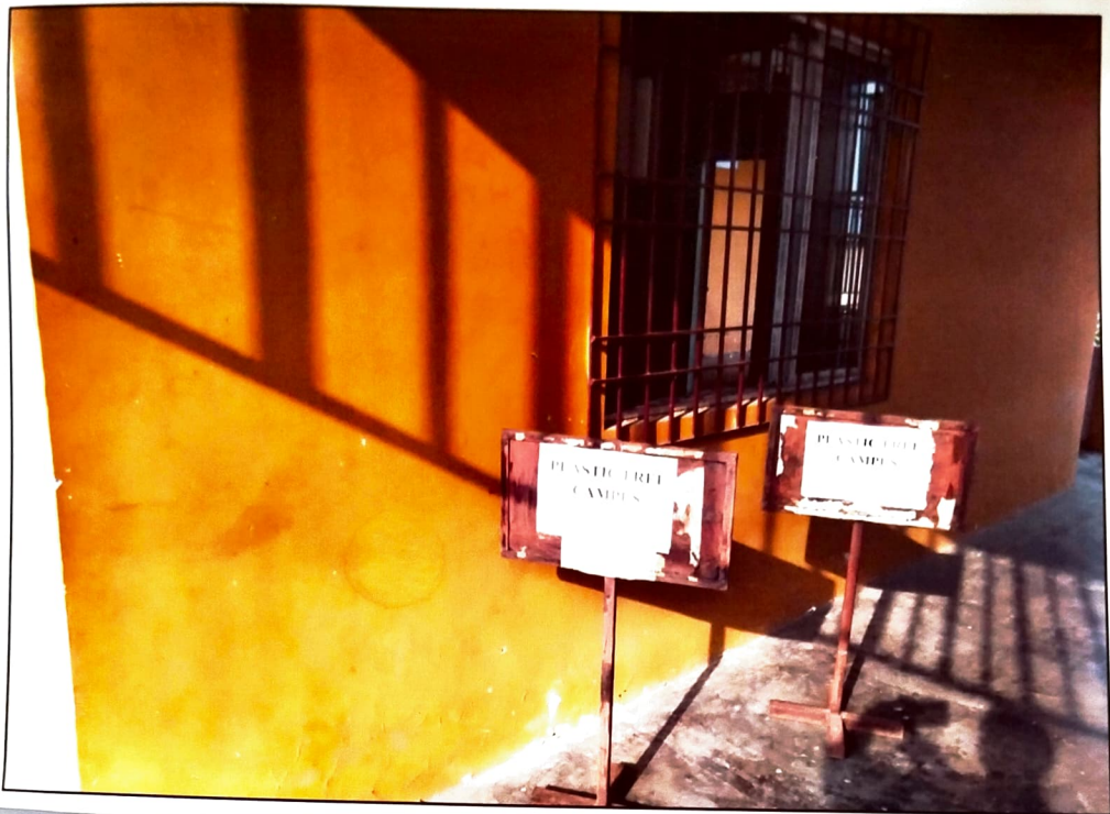
Plastic Free campus